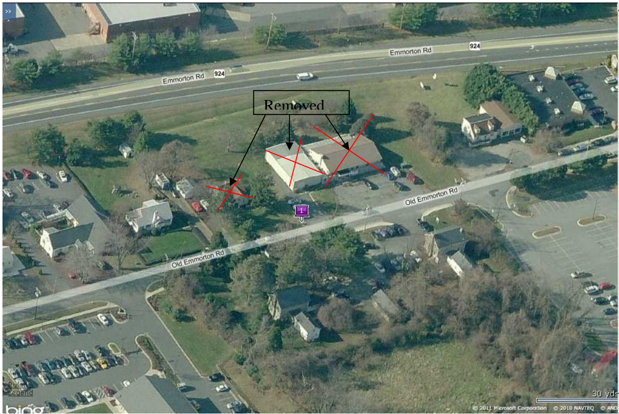
Aerial View - 1