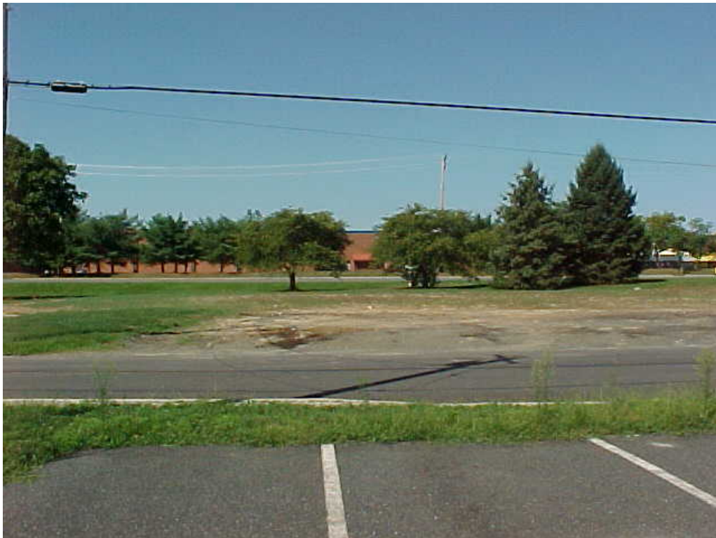
Ground View - 2