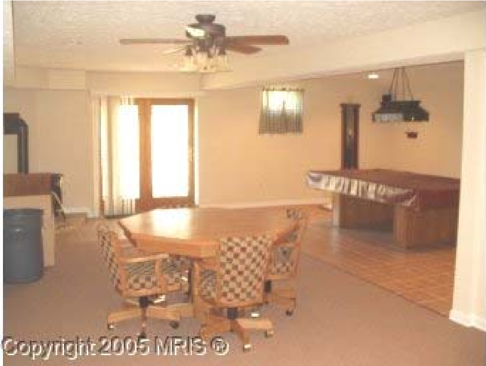
Basement with Pool Table