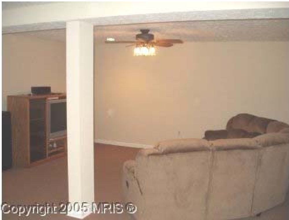
Another View of the Basement